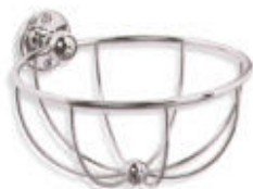
LB 4506 CLASSIC CIRCULAR REAL SPONGE BASKET