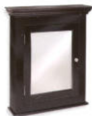
BK 3701 LARGE CLASSIC MEDICINE CABINET IN BLACK