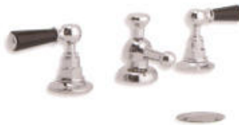
BL 1461 CLASSIC BLACK LEVER BIDET THREE HOLE WITH ASCENDING SPRAY AND POP-UP WASTE