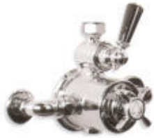
BL 8700 EXPOSED BLACK LEVER GODOLPHIN THERMOSTATIC MIXING VALVE