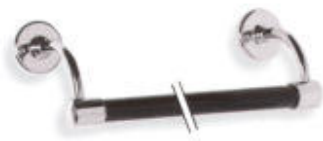
BK 4507 BLACK LARGE BORE (1 1/2") STOVE ENAMELLED TOWEL RAIL (STANDARD 20") ALSO AVAILABLE BK 4508 LONG 30"