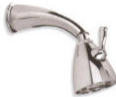
LB 1771 CLASSIC EIGHT JET BRUNSWICK ADJUSTABLE HEAD WITH SHOWER ARM