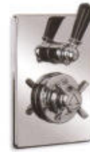
BL 8706 CONCEALED BLACK LEVER GODOLPHIN THERMOSTATIC MIXING VALVE