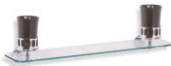
BK 4517 GLASS SHELF WITH TWIN FINE BONE BLACK CHINA MUGS