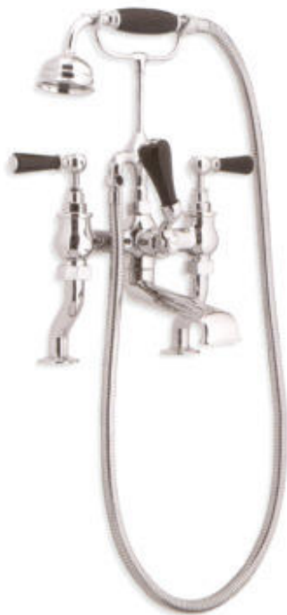
BL 1100 CLASSIC BLACK LEVER BATH SHOWER MIXER DECK MOUNTED (ALSO AVAILABLE BL 1166 WALL MOUNTED)