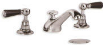
BL 1216 EDWARDIAN BLACK LEVER THREE HOLE BASIN MIXER WITH POP-UP WASTE