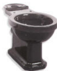
BK 7207 CLASSIC BLACK CLOSE COUPLED PAN