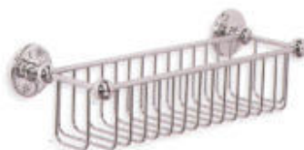
LB 4510 CLASSIC SHOWER BOTTLE RACK