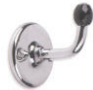
BK 4512 SINGLE ROBE HOOK WITH BLACK CERAMIC ACORN