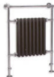
BK 3202 CLASSIC BALL JOINTED CAST IRON RADIATOR IN BLACK H37.5" X W26.5" X D6" (H953 X W669 X D205 MM)