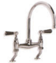
BL 1517 BLACK LEVER BRIDGE MIXER WITH 9" SPOUT (ALSO AVAILABLE BL 9007 WITH 6.5" SPOUT)