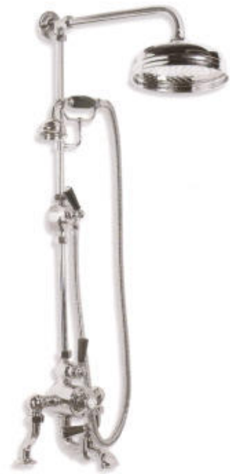
BL 8825 EXPOSED BLACK LEVER THERMOSTATIC BATH AND SHOWER VALVE WITH RISER KIT, HANDSET, LEVER DIVERTER AND 8" ROSE (ALSO AVAILABLE BL 8824 WITH 6" ROSE)