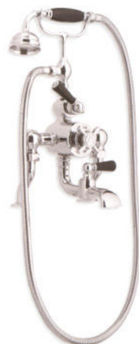
BL 8823 EXPOSED BLACK LEVER GODOLPHIN THERMOSTATIC BATH AND SHOWER VALVE WITH CLASSIC HANDSET