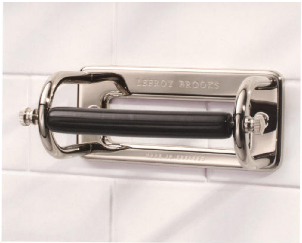
Above: BK 4500 Black Ceramic Paper Holder.