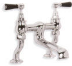
BL 1107 CLASSIC BLACK LEVER BATH FILLER DECK MOUNTED (ALSO AVAILABLE BL 1151 FOR WALL MOUNTING)