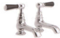
BL 8030 CLASSIC BLACK LEVER LONG NOSE BASIN PILLAR TAPS (1 PAIR) (ALSO AVAILABLE BL 8034 BATH PILLAR TAPS - 1 PAIR)