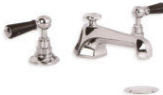
BL 1228 MACKINTOSH BLACK LEVER THREE HOLE BASIN MIXER WITH POP-UP WASTE