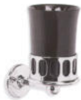
BK 4502 BLACK FINE BONE CHINA MUG AND HOLDER