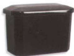
BK 7208 CLASSIC BLACK CLOSE COUPLED CISTERN WITH SIDE FLUSH (REQUIRES CISTERN FITTINGS LB 7299)