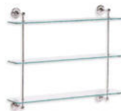
LB 4518 THREE TIER GLASS SHELF

ALL PRODUCTS ARE AVAILABLE IN SILVER NICKEL, CHROME, ANTIQUE GOLD OR SATIN NICKEL FINISHES