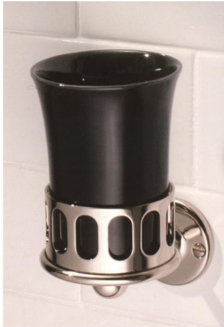
Above: BK 4502 Classic Black Fine Bone China Mug and Holder.