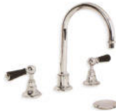
BL 1230 TUBULAR BLACK LEVER THREE HOLE BASIN MIXER WITH CLICK-UP WASTE