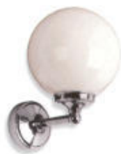
LB 4000 CLASSIC SINGLE WALL BRACKET WITH 6" OPAL GLOBE