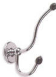
BK 4511 DOUBLE ROBE HOOK WITH BLACK CERAMIC ACORNS