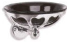
BK 4505 CAST BRASS SOAP HOLDER WITH BLACK FINE BONE CHINA DISH