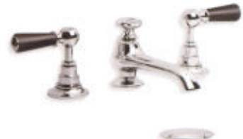
BL 1224 CONNAUGHT BLACK LEVER THREE HOLE BASIN MIXER WITH POP-UP WASTE