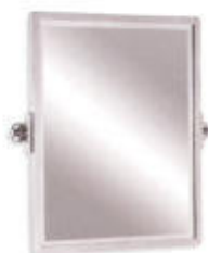
LB 4509 CLASSIC TILTING MIRROR WITH BEVELLED GLASS