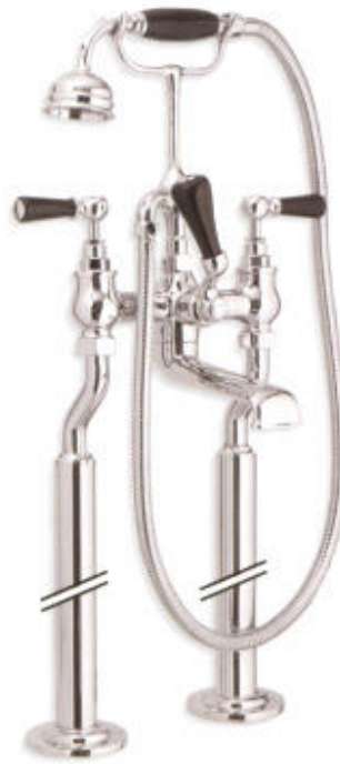
BL 1144 CLASSIC BLACK LEVER BATH SHOWER MIXER WITH STANDPIPES (ALSO AVAILABLE BL 1145 WITH ADJUSTABLE STANDPIPES FOR MOUNTING UNDER BATH RIM)