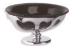
BK 4515 FREESTANDING SOAP DISH HOLDER WITH BLACK FINE BONE CHINA DISH