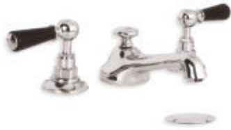
BL 1220 CLASSIC BLACK LEVER THREE HOLE BASIN MIXER WITH POP-UP WASTE