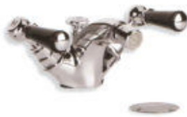
BL 1195 CLASSIC BLACK LEVER BIDET MONOBLOC WITH POP-UP WASTE (ALSO AVAILABLE BL 1195 BASIN MONOBLOC WITH POP-UP WASTE)