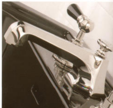
Below: BL 1228 Mackintosh Black Lever Three Hole Basin Mixer with Pop-up Waste.