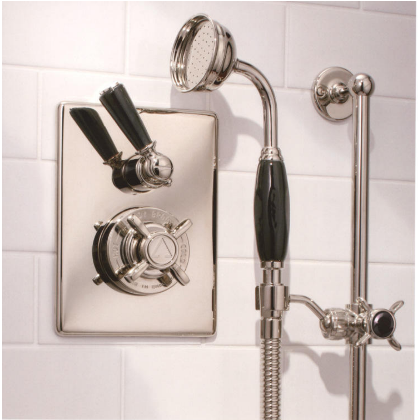
Above: BL 8717 Concealed Black Lever Thermostatic Mixing Valve with Sliding Rail and Handset.

Finishes – Silver Nickel, Chrome, Antique Gold and Satin Nickel.