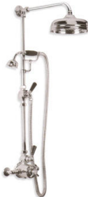
BL 8704 EXPOSED BLACK LEVER THERMOSTATIC VALVE WITH RISER KIT, HANDSET, LEVER DIVERTER AND 8" ROSE (ALSO AVAILABLE BL 8703 WITH 6" ROSE)