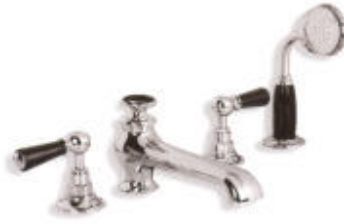
BL 1280 CLASSIC BLACK LEVER FOUR HOLE BATH SET WITH DIVERTER AND PULL-OUT SHOWER