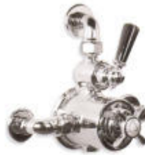
BL 8725 EXPOSED BLACK LEVER GODOLPHIN THERMOSTATIC MIXING VALVE WITH TOP RETURN BEND