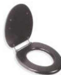
LB 7242 CLASSIC BLACK LAVATORY SEAT WITH BAR HINGE