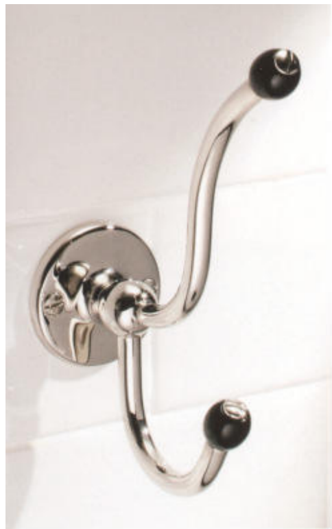
Left: BK 4511 Double Robe Hook with Black Ceramic Acorns.