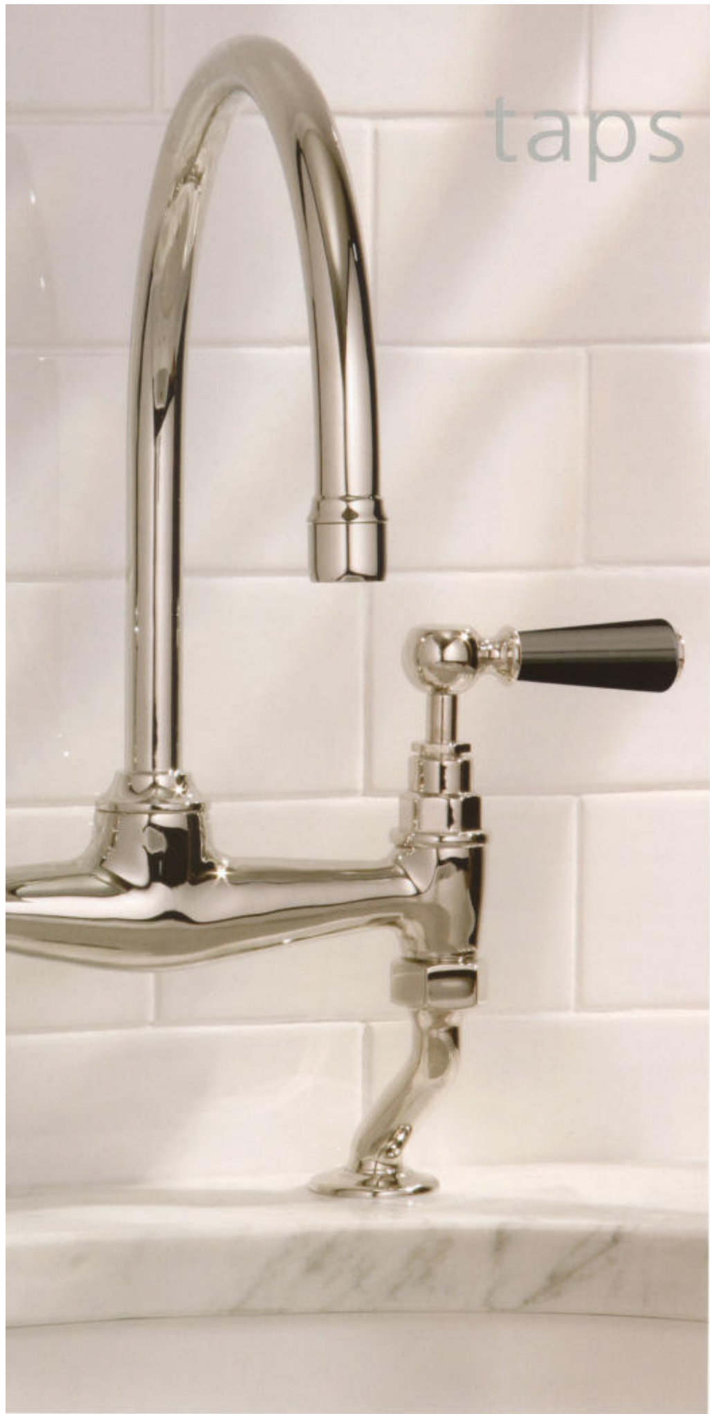
Left: BL 1517 Deck Mounted Black Ceramic Lever Bridge Mixer.