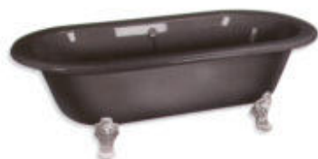
BK 8623 SUPER SIZE DOUBLE ENDED BATH IN BLACK L77" X W37.5" X H24" INCL FEET (L1950 X W950 X H610 MM)