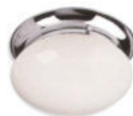
LB 4004 CLASSIC CEILING LIGHT WITH 10" OVAL OPAL GLOBE