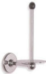
BK 4501 SPARE PAPER HOLDER WITH BLACK CERAMIC ACORN