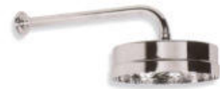
MK 1774 MACKINTOSH 8" APRON ROSE WITH SHORT ARM (SUITABLE FOR CUBICLE) ALSO AVAILABLE LB 1774 CLASSIC ROSE - SEE PICTURE BELOW