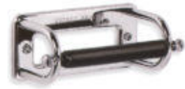
BK 4500 BLACK CERAMIC PAPER HOLDER