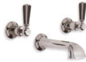
BL 1152 CLASSIC BLACK LEVER CONCEALED WALL BATH FILLER (ALSO AVAILABLE BL 1212 WALL MOUNTED BASIN FILLER)