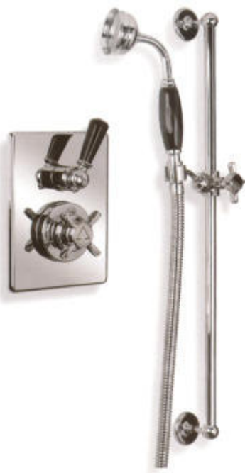
BL 8717 CONCEALED BLACK LEVER THERMOSTATIC MIXING VALVE WITH SLIDING RAIL AND HANDSET